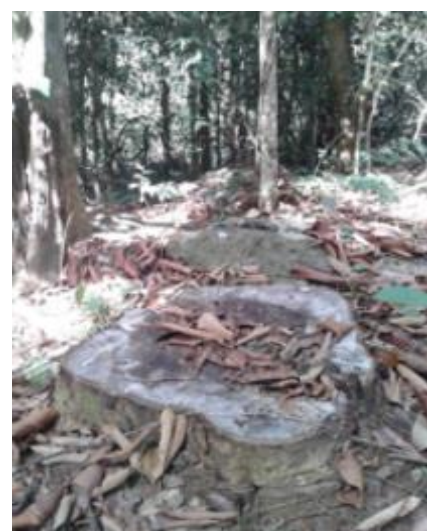
Above: Giant Endemic Hora Trees