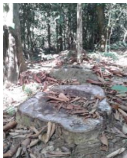
Above: Giant Endemic Hora Trees