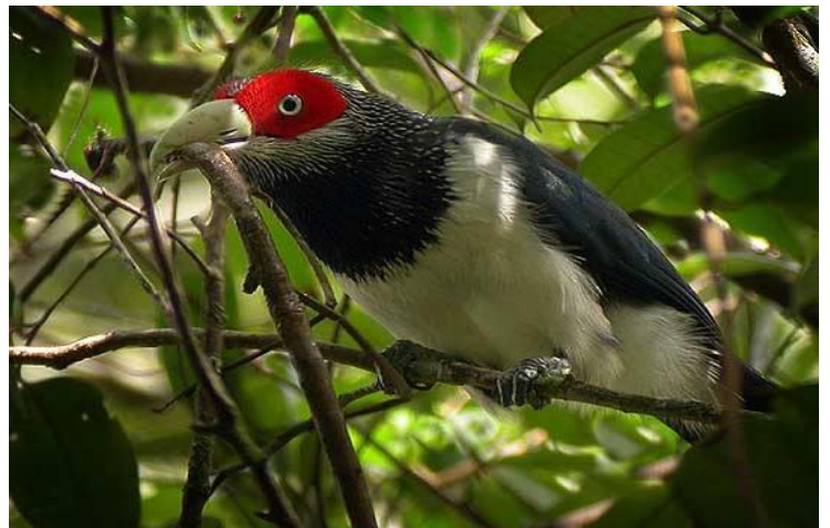
(Endemic Red-faced Malkoha)