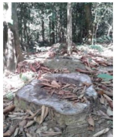
Above: Giant Endemic Hora Trees