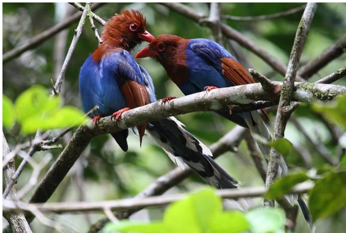
(Endemic Sri Lanka Blue Magpie)

In addition to ecological services, rainforests also provide economical and recreational value. Hundreds of streams, beautiful waterfalls and colourful birds make rainforests a photographer's dream or the perfect gateway from the noisy polluted cities. Many companies operating in the sectors of "Eco" hotel and "Adventure" tourism benefit directly from rainforests as well as villagers engaged in sustainable harvest of rainforest resources.