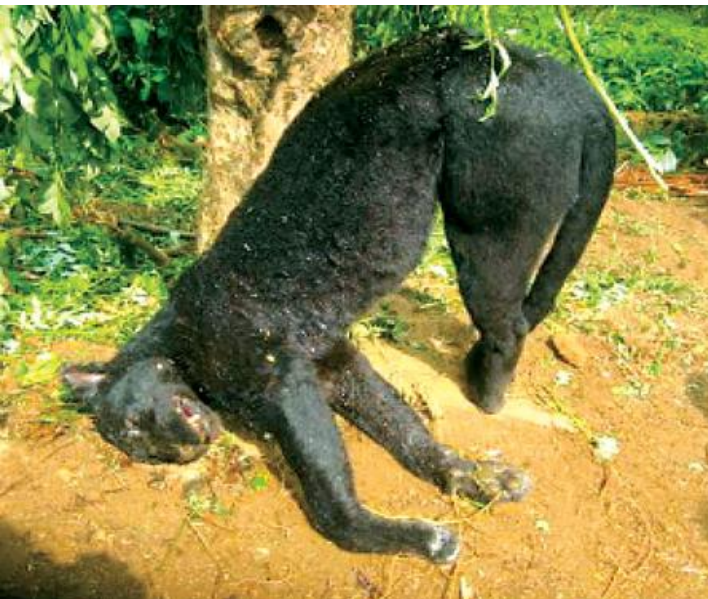
(Rare Black Leopard in buffer zone of Sinharaja Rainforest killed by a poacher's snare – Nov 2013)

Many buffer-zone rainforest lands are still privately owned. Increasingly these lands are being sold and forests cut down for monoculture plantations.